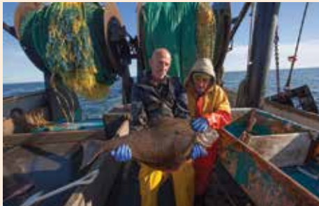
Past The Breakwater